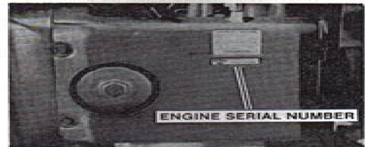
Figure 4 (19.5 H.P. Tractor) Location of Engine Serial Number

TRANSMISSION SERIAL NUMBER. The transmission serial number is located on the transmission cover, figure 5.