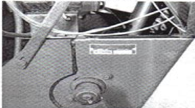
Figure 2 (19.5 H.P.) Location of Tractor Serial Number

ENGINE SERIAL NUMBER. The engine serial number is located on the engine shroud, figure 3, 10, 12, 14, 16 H.P., figure 4, 19.5 H.P.