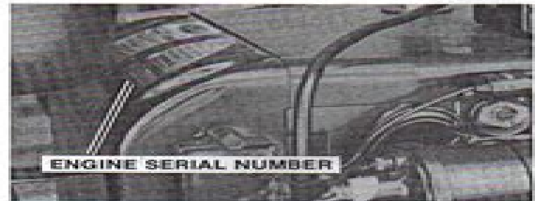
Figure 3 (10, 12, 14 & 16 H.P.) Location of Engine Serial Number

ENGINE SERIAL NUMBER. The engine serial number is located on the engine shroud, figure 2.