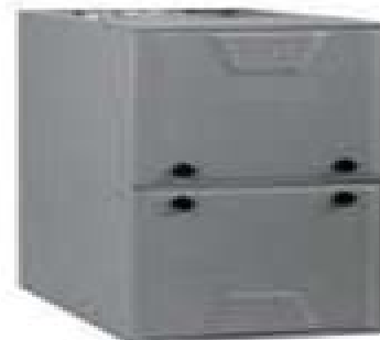
Illustrations and photographs are only representative. Some product models may vary.