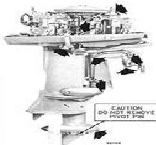
Figure 2-1. Starboard Side, 40 H.P. Electric