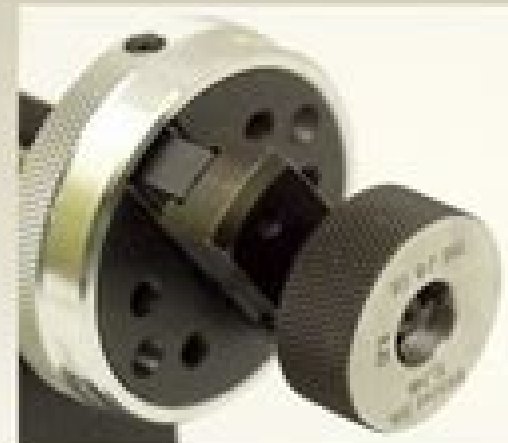
Internal Thread Gaging System Series GJ-55 w/ Ring Master Setting

THE JOHNSON GAGE COMPANY 600 Maple Street, Suite 100, Franklin, MA 01916 (508) 526-1000 www.jgthread.com