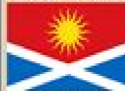
Dominion of Darien