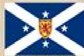
Nova Scotian Dominion