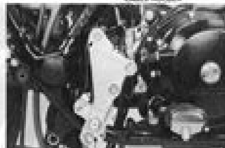
BRAKE PEDAL BRACKET

Remove the brake pedal, brake pedal bracket from mounting bolt and remove the upper bolt.