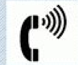
Volume control telephone