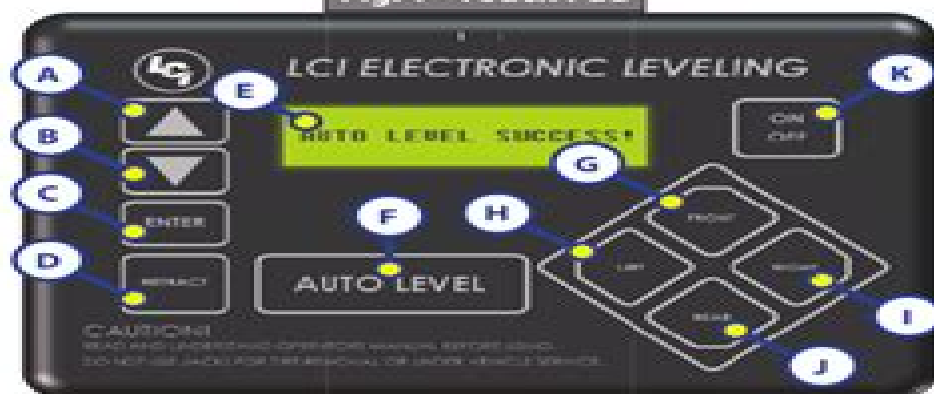
Fig. 1 - Touch Pad