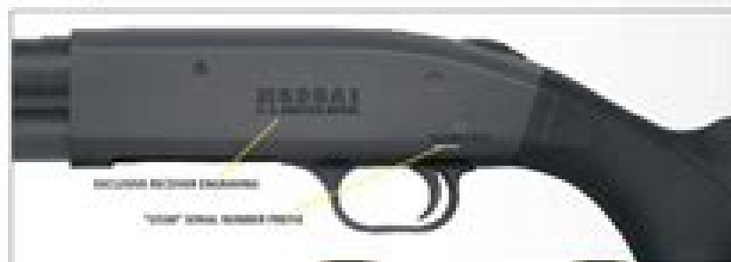
EXCLUSIVE RECEIVER ENGRAVING "USSM" SERIAL NUMBER PREFIX