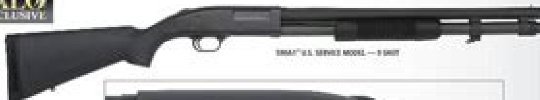
590A1™ U.S. SERVICE MODEL — 12 SHOT