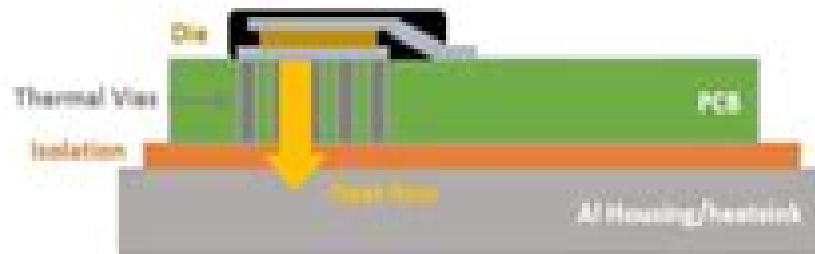
Today's cooling method - PCB Vias