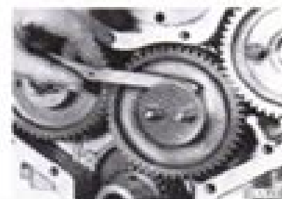
Figure 10. The effect of the initial concentration of the monomer on the polymerization of l -lysine.

10 The respondent is correct because, although it is true