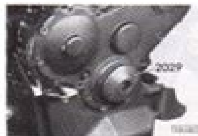
Fig. 1. Testing area (center) = handling.