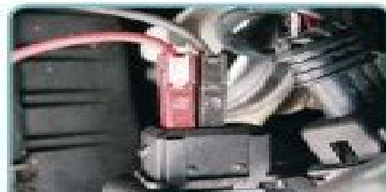
F.2.1 - Procedimento de medida de resistência do sensor CKP