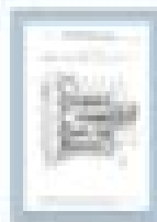
Fig. 7 - Control valve cross section.