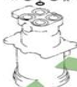
センタージョイント CENTER JOINT