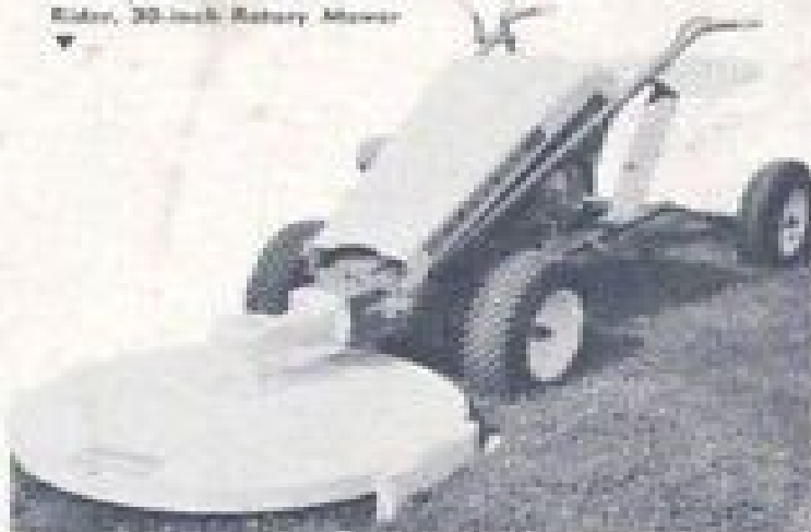
Gravelly Concrete Target. Rules: 30-inch Rotary Arrows