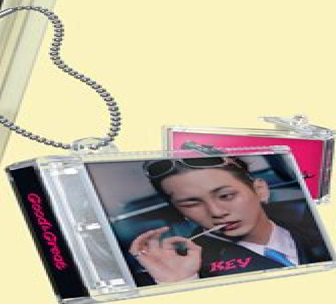
SMini Case & Ball Chain