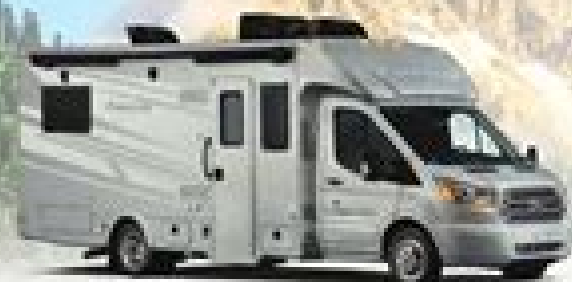
PENTAR Full body paint shown on Transit