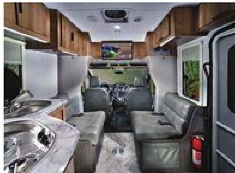
TS2381 shown in Black Diamond Walnut cabinetry with Slate decor.