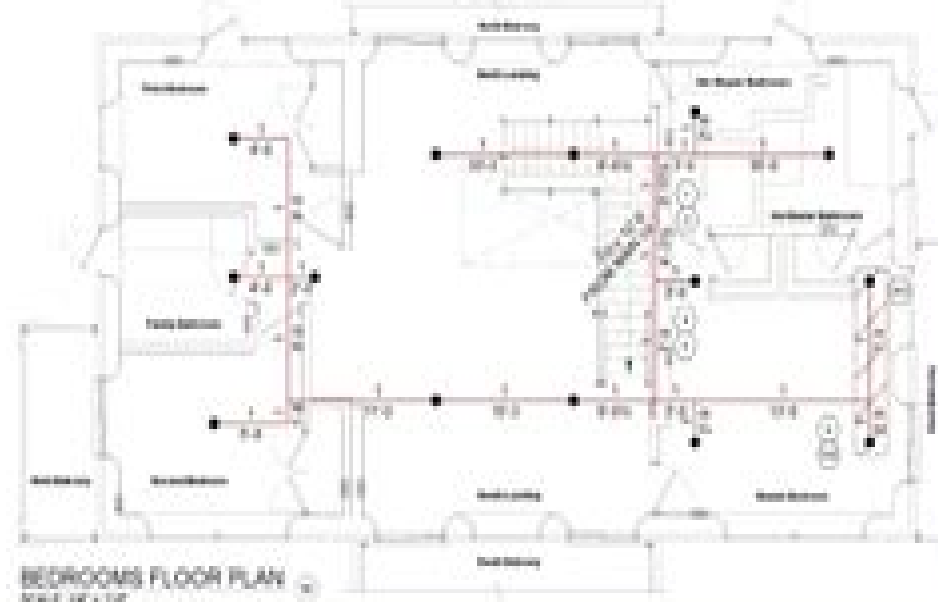
REWORKED FLOOR PLAN 2001.08.10