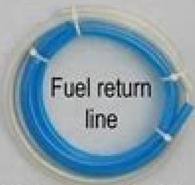
Fuel return line