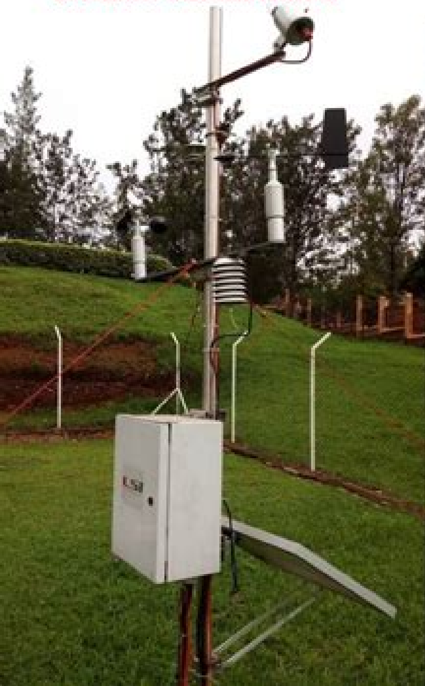
AUTOMATIC WEATHER STATION