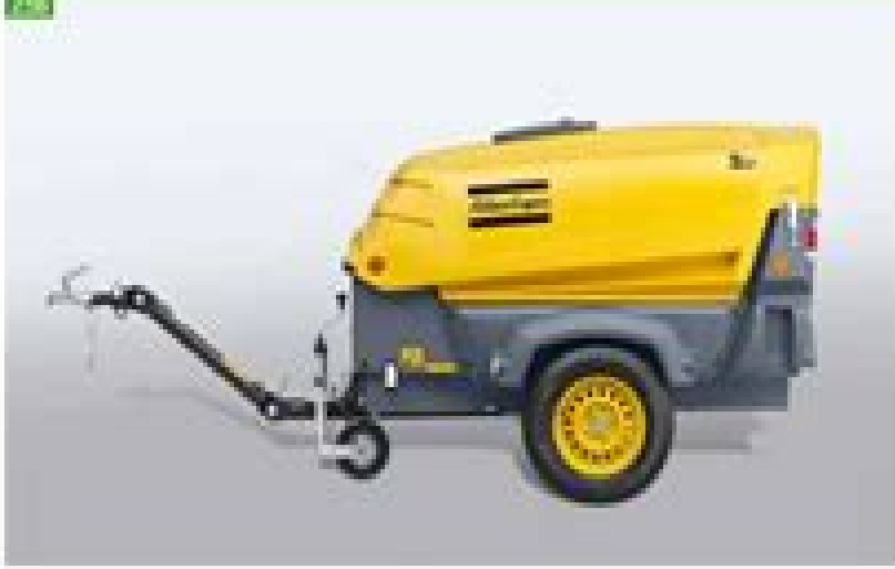
Un compresor transportable moderno para trabajos de construcción

frecuentemente informes de estado de la instalación de compresores en distintos niveles, desde una visión general hasta detalles de máquinas específicas.