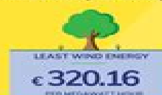
MONTHLY PRICE COMPARISON