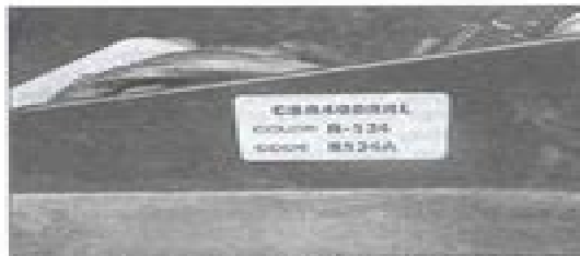
The colour code label is under the passenger seat