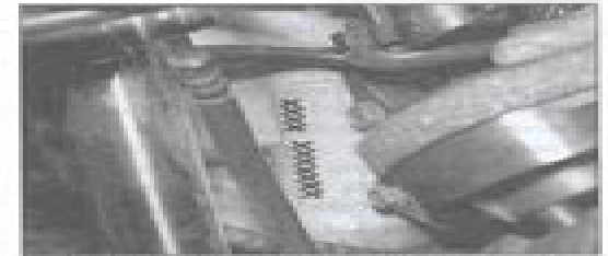
The frame number is stamped on the right-hand side of the steering head