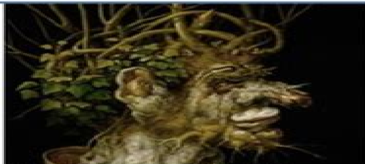
- « L'hiver » peint vers 1562 par Arcimboldo