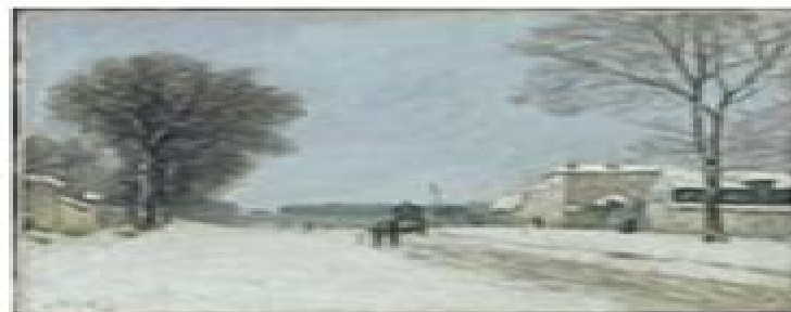
- EN HIVER EFFET DE NEIGE - peint au 4e quart 19e siècle par Alfred Sisley

Le visage et le cou sont formés par une souche d'arbre dont les excroissances et les racines dessinent le relief. La cavité de la bouche est comblée par un lichen. La barbe est formée de racines, de nombreuses crevasses tapissent la peau comme autant de gerçures.