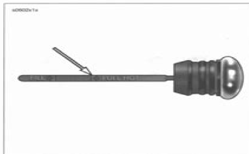
Figure 1-2. Oil Tank Dipstick Upper Groove