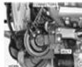
Fig. 10-10-102 Insert the special tool into the tensioner body so the heads of the tool is in the tensioner and the rope can pass above the valve in the tensioner. (There should be space between the bottom of the tool and the tensioner body. Do not engage the teeth on the special tool with the valve in the tensioner body.)

Remove the cam chain tensioner after test and timing marks.