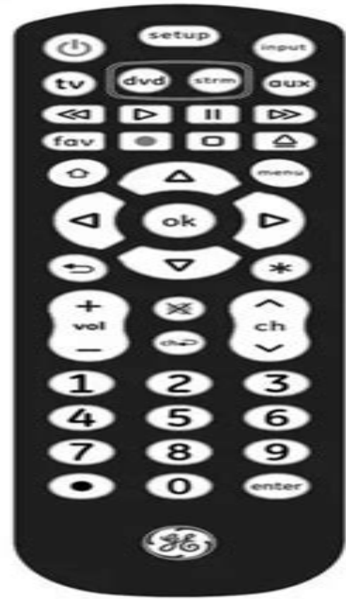
MODELS 33705, 33706 33707, 33708, 34456