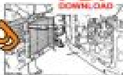
Figure 2. Engine and air filter housing.