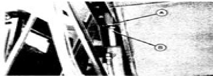
A - Jam Nut B - Cylinder Rod

Adjust by loosening jam nut (A) and turning the cylinder rod (B). Retighten nut.