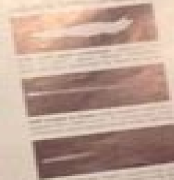
Positioning built and out