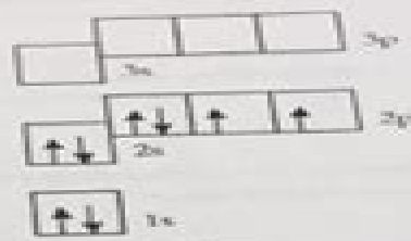
Oxygen 1s^2 2s^2 2p^4