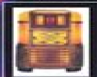
1941 Rockola Master