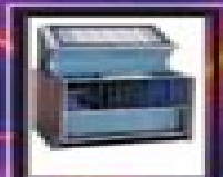
1972 Rockola 449