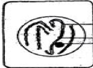
চিত্র : ক

২। নিচের চিত্রগুলো লক্ষ কর এবং প্রশ্নগুলোর উত্তর দাও: