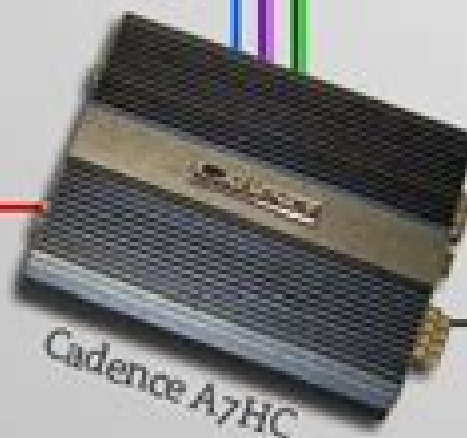
Stinger MAXI Distribution