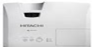
Screen Size 4:3 Throw Distance