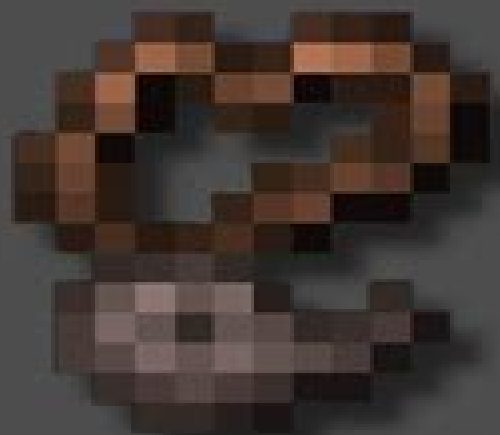
Amulet of the Heretic