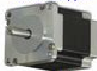
A (2nd Y) Axis Stepper