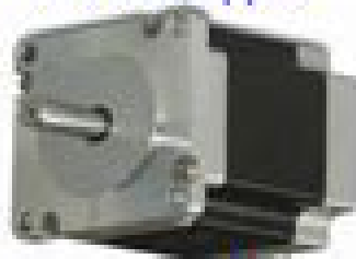
Z Axis Stepper