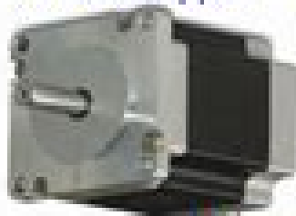
Y Axis Stepper