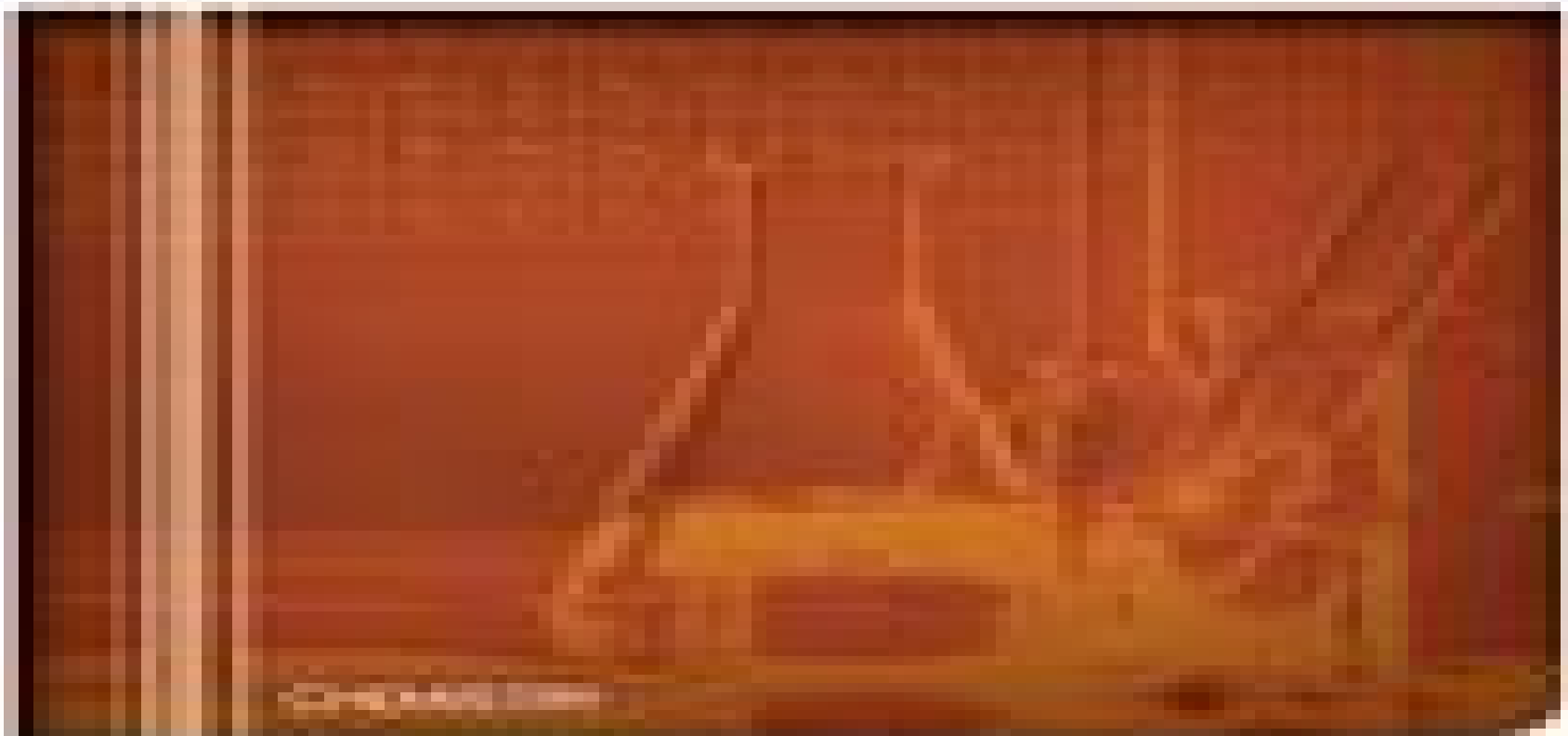
Simple Relationship Between Stock, Assets and Liabilities