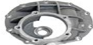
Ford 9 Third Member