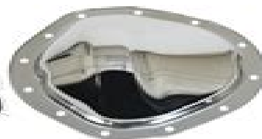
GM 12 Bolt