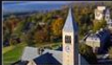
Fiske Guide (323)

Comprehensive up-to-date school lists compiled by the Fiske editorial team