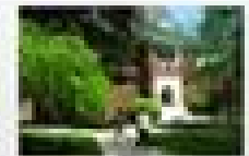
6. Alma College