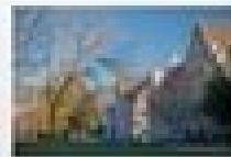
2. Agnes Scott College