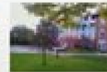
5. Allegheny College