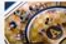
3. Albion College