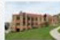
4. Alfred University