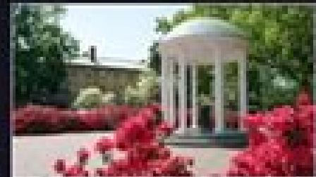
Best Buy Public (10)