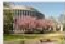
1. Adelphi University