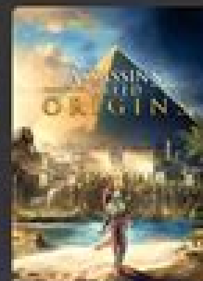
Assassin's Creed Origins 4 install