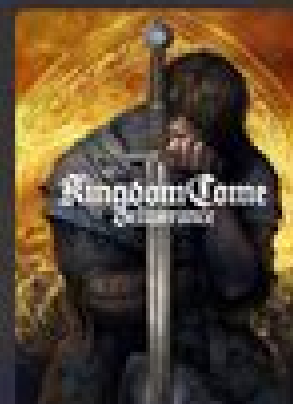
Kingdom Come: Deliverance 4 install