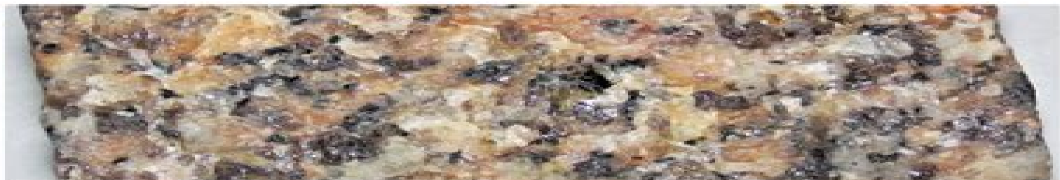
Granite 34 (49200986291)

Igneous rock can form interesting landmarks. _____, in the USA, is made from a type of igneous rock called phonolite porphyry.