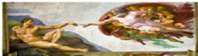
Sistine Chapel – Creation of Adam