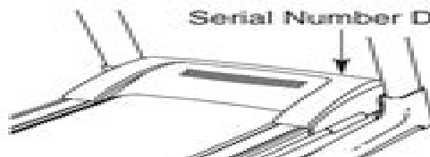
Serial Number Decal

Find the serial number in the location shown below. Write the serial number in the space above for reference.