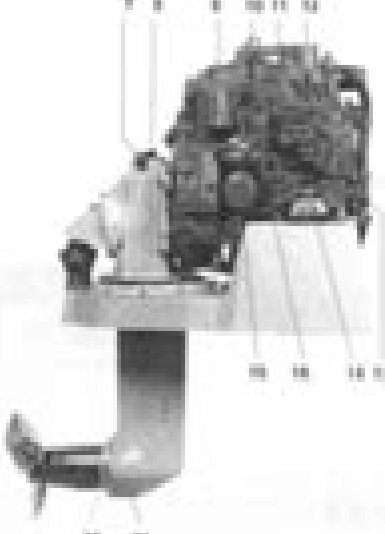
MD2012AB & MD20