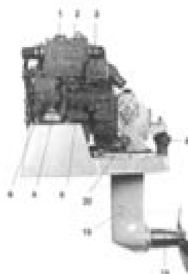
MD2012AB & MD20