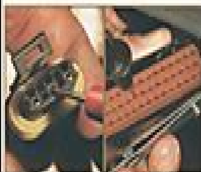
Fig. 3.1. Exemplo de verificação de continuidade no chicote do sensor VSS (entre os bornes 2 do sensor e 28 do MC).