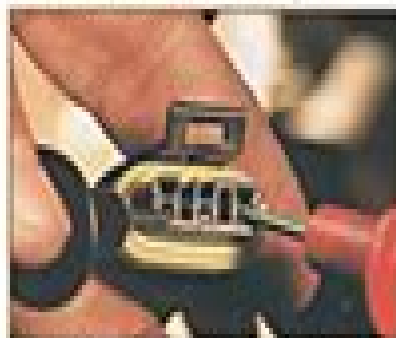
Fig. 3.3. Exemplo de verificação de curto-circuito no chicote do sensor VSS (entre os bornes 1 e 3 do terminal elétrico do sensor).