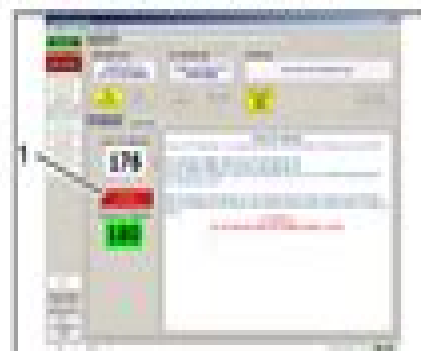
1. TPS Calibration button

On the Settings screen of the diagnostic software, click the "Set TPS Calibration" button.