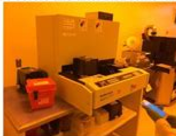
GaSonics PR Asher