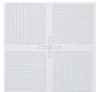
After P.R. removal