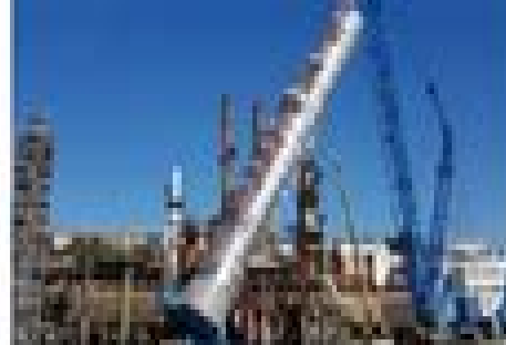
COLUMN, DISTILATION, FRACTION