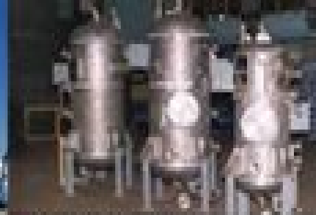
DRUMS, PRESSURE VESSEL