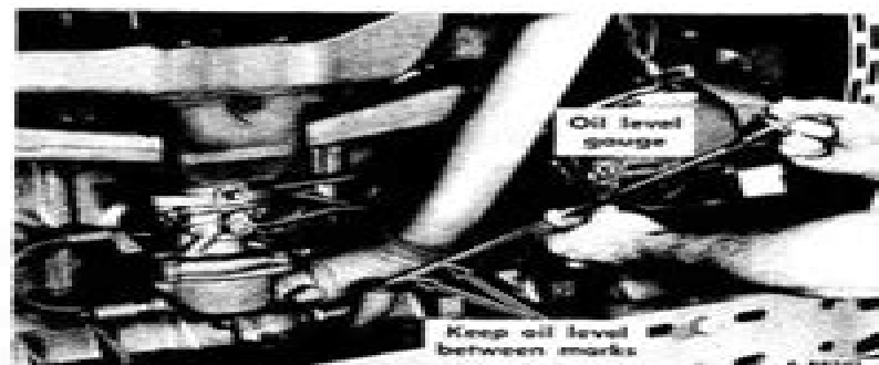
Illustr. 120 Crankcase oil level gauge. (gasoline and LP Gas engines).

The gasoline and LP Gas engines are equipped with an oil filter which continually cleans the oil while the engine is running. The diesel engine is equipped with two oil filters. To obtain the full benefit from the filter, replace the used element with a new one every second time the oil in the crankcase is changed. (After every 200 hours of operation). Cleaning the old element is not satisfactory.